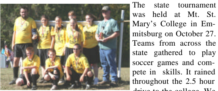
St. Mary's Team #2 won the silver medal at the Local Tournament and at the State.